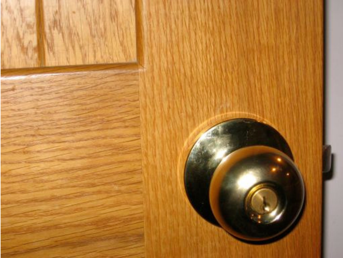
Figure 5. Roundover corner detail.