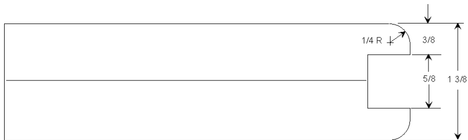
Figure 2. Profile of the stiles.