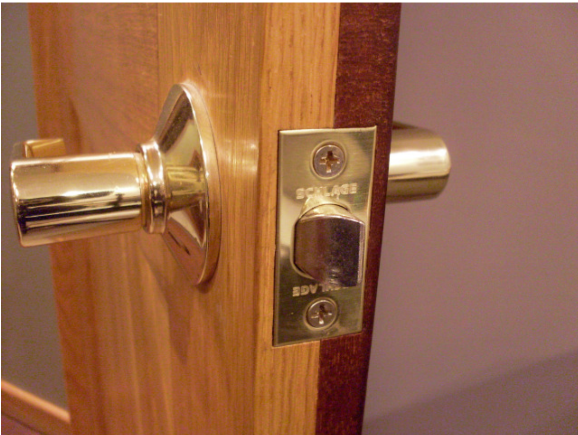
Figure 4. Edge view of door.

When the glue is set, all that is necessary is cleanup of the joints, installation of hardware, final sizing, and finishing.